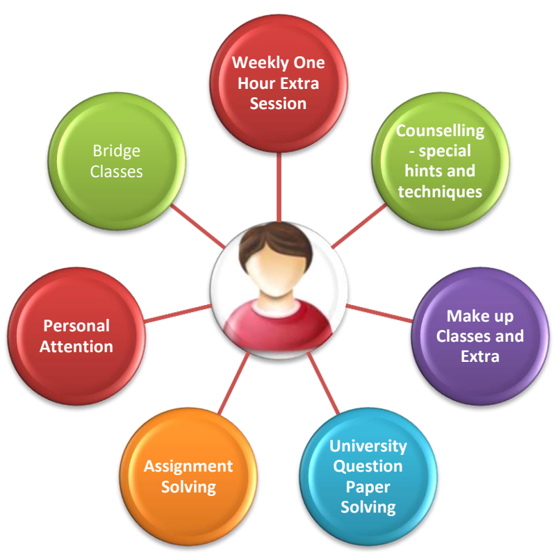
Fig. 2 Proposed activates for Slow Learner

\hfill \Box Learners shall be encouraged to complete NPTEL/Coursera/Udemy/Advanced courses.