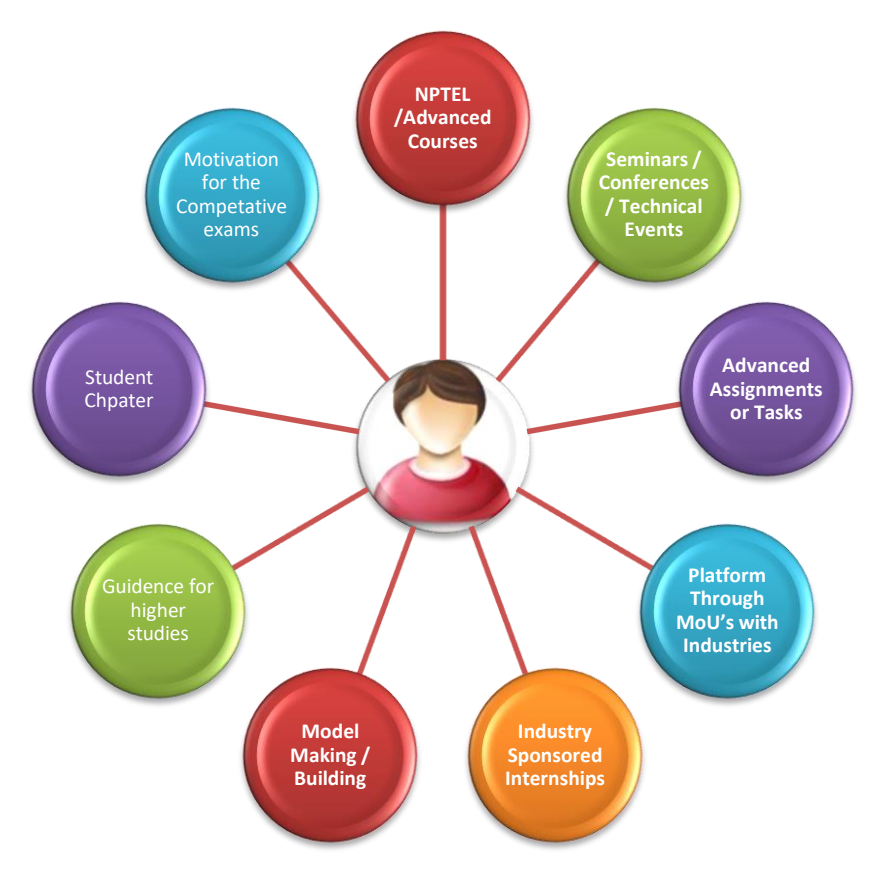
Fig. 3 Activities Conducted for Transitional & Advanced Learner

The subject teacher is responsible for implementing the complete process as per the manual.